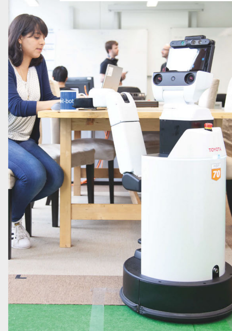
Stand 08/2018