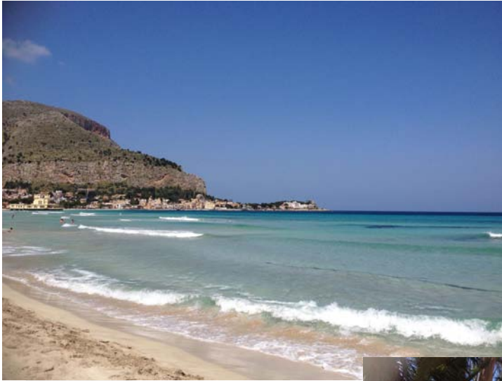
Beach of Mondello (30 min per bus)