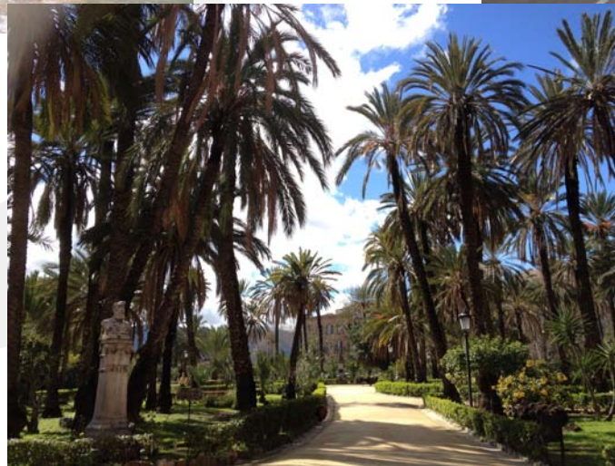
Our daily way to University