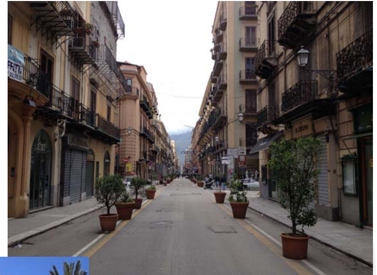
Main Street of Palermo